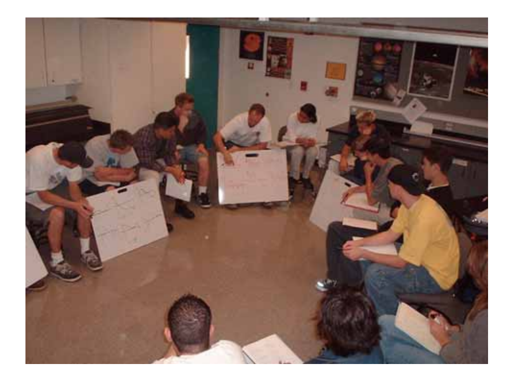
Figure 12. Typical circle white board presentation

For the paper airplane exercise the students are then asked to share the difficulties in making the paper airplanes. What terms were ambiguous? What assumptions did they have to make? This portion of the discussion is typically very short. The instructor then asks the group why they might have been given this activity. What is to be learned? What role does this activity play for the rest of the classroom discussions? The discussion of these questions has been very dynamic and positive. Students quickly comment that terms need to be defined and agreed upon by the class and that pictures are often better than words. The students reach agreement on these questions quickly and without much conflict. When the discussion is winding down the instructor steps in and reviews what