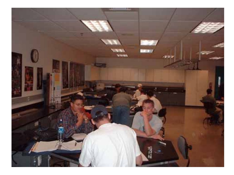
Figure 13. Workspace for small groups in a modeling classroom

Some of the modeling discourse classrooms used in this research had less than optimal designs. However, the classrooms were physically arranged to be as close to optimal as possible. The CGCC classrooms were very well designed for modeling discourse management. A diagram of the CGCC classroom can be seen in Appendix D .